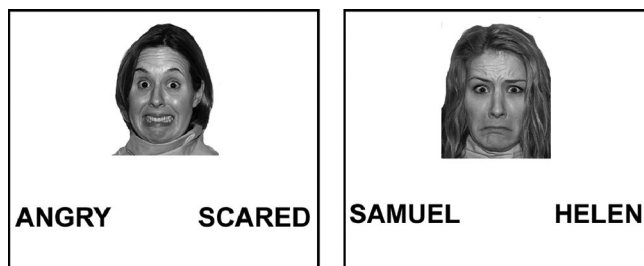
Figure 1. The left panel is an example of an affect labeling trial in which participants select the appropriate affect label characterizing the facial expression of the target face. The right panel is an example of a gender labeling (control) trial in which participants select the gender-appropriate name for the target face.

Participants completed the MAAS (1), a 15-item measure assessing trait levels of mindlessness (e.g., "I find it difficult to stay focused on what's happening in the present," all items were reverse scored; sample \alpha = 0.78 ). Previous studies with undergraduates, community adults, and advanced meditation practitioners have shown that this measure has good psychometric properties and shows strong positive associations with multiple measures of